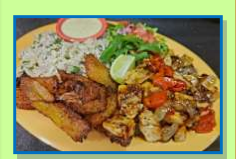
La Gordita Puerco