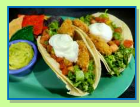
Coconut Shrimp Taco