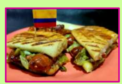
Grilled Choripan Sandwich