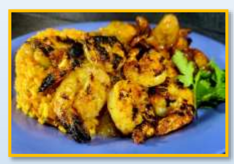
Mango Garlic Shrimp