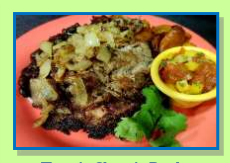
Tropi Chopi Pork

2 Slices of Charbroiled Pork Loins and grilled onions, Glazed in Guava sauce served with Seasoned Green Rice, sweet plantains and side salad