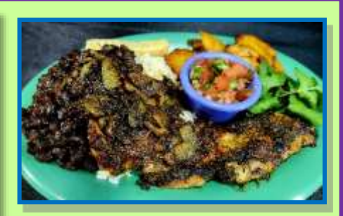
Jamaican Jerk Chicken

Seasoned and garnished ground beef, served on white rice, Tostones, side salad and sliced Avocado.