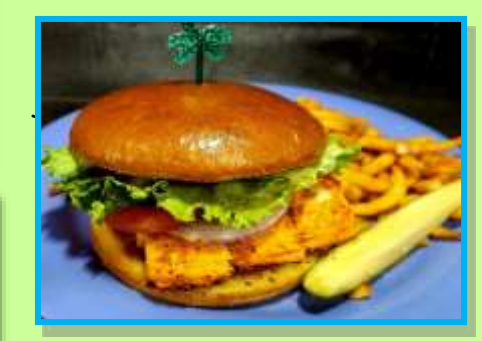
Grilled Mahi Sandwich